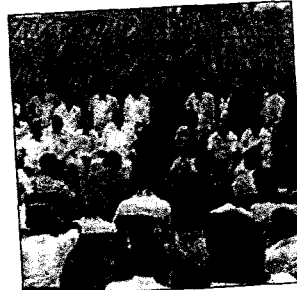
AN APPEAL TO RESIDENTS: A swami rushed to the village and urged residents to end the practice

The MP said he would return to the village. "They are my voters, after all. I will do it takes to make